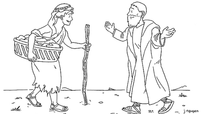
THE PRODIGAL SON RETURNS TO DO HIS LAUNDRY