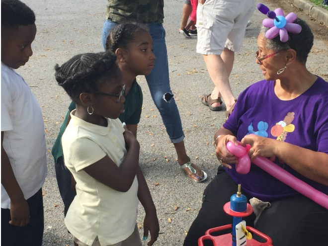
An important question about balloon animals