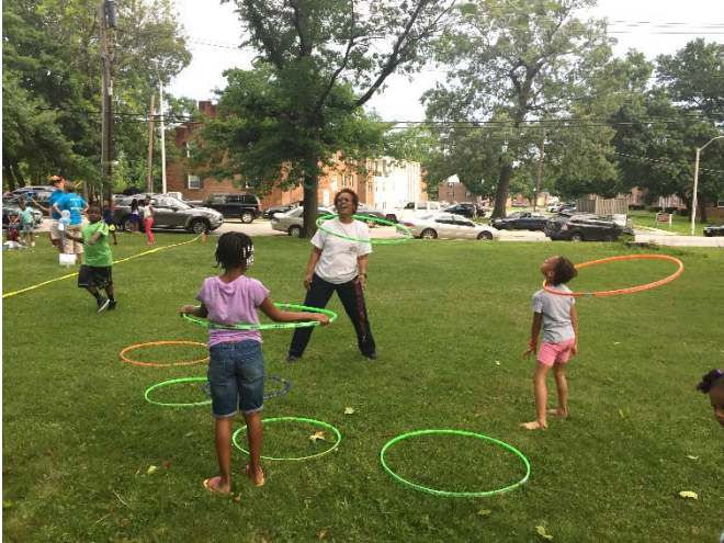
Who's that with the mad hula hoop skills?