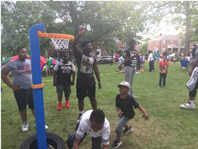
Hmm, guess height matters in basketball