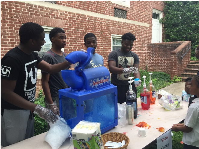
Men at work