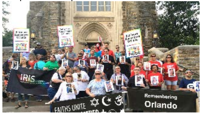
Dozens participated in a vigil for the Pulse nightclub victims in Charles Village.