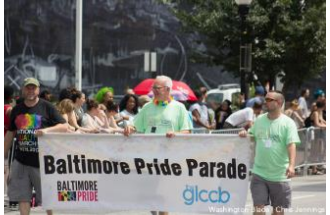
The Baltimore Pride parade was held on Saturday, June 17.

We started as two churches, grew to eight that year, 20 the following year, etc. Those faith groups now number in the 40’s. We don’t speak of churches anymore because there are four synagogues and two Buddhist groups that participate. Not everyone marches on Saturday (obviously the Jewish groups can’t) some are very small – but all apparently desire to be known as a member of a faith organization that supports LGBTQ rights and is a welcoming community.