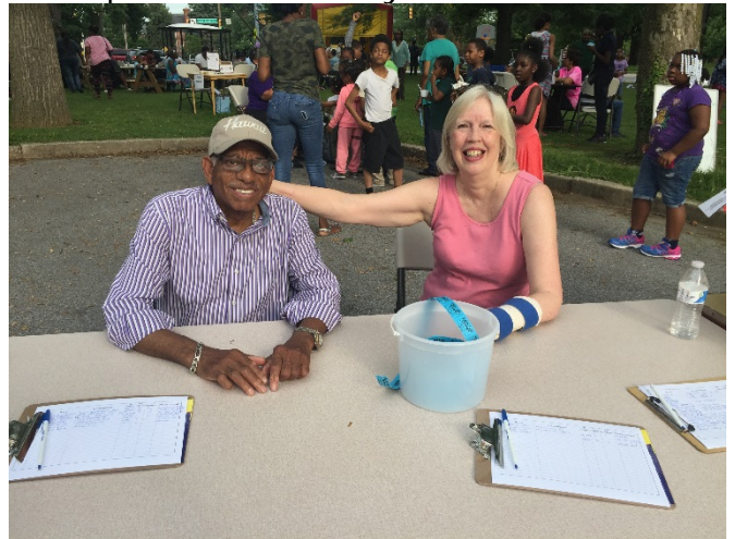
Smiling welcome to all