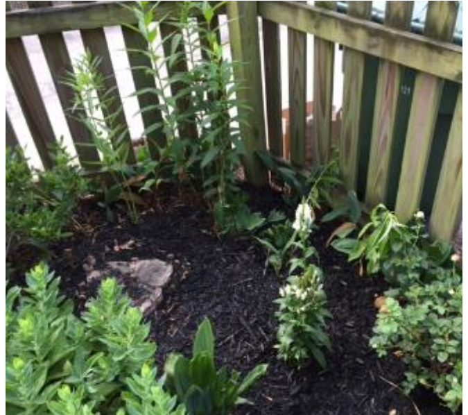
Pictured: offending stump and little rose bush

That was expensive enough so I did not have the stump removed. Mistake! Every year, I get shoots of crepe myrtle popping up which I methodically pull out. Two years later, that tree is still showing signs of life despite my attempts to kill that stump! Even the crepe myrtle remains contain a lesson: The forces of life in our lives are strong and resilient and persistent. They are surprisingly victorious. Trust them!