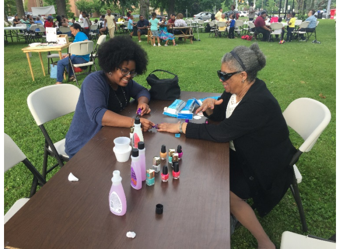
She's polished in all ways