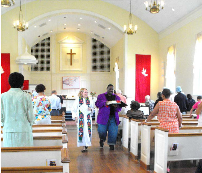
Men of the Church Sunday on Father's Day has become a Faith Church Tradition.